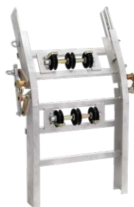
Angle track section Art. No. 02828