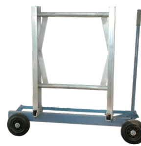
Wheeled undercarriage Art. No. 02822