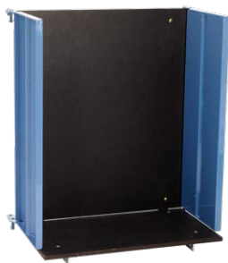
General purpose platform Art. No. 02893