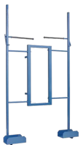
Sheet carrier Art. No. 02831