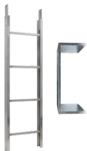
Ladder section 2 m 200 kg Art. No. 03378