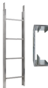
Ladder section 2 m 250 kg Art. No. 02888