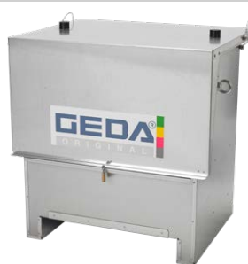
Liftbox Art. No. 46309

For further accessories visit: www.geda.de