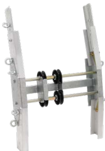
Angle track section Art. No. 02877