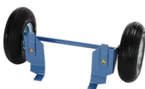
Transport axle Art. No. 02886