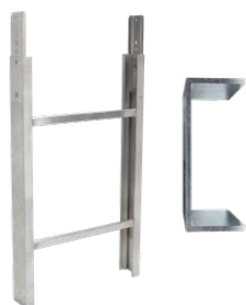
Ladder section 1 m 200 kg Art. No. 03379