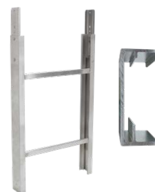
Ladder section 1 m 250 kg Art. No. 02889