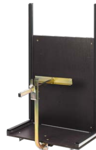
Solar platform Art. No. 02908