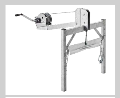
Hand winch (41 m rope) Art. No. 01908