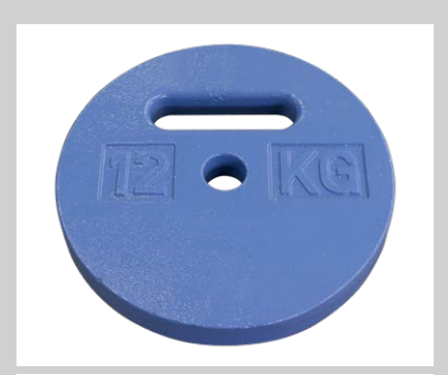
Ballast weight Art. No. 01912