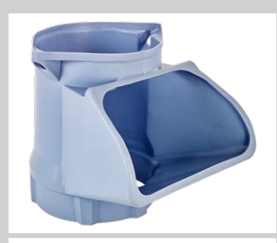
Dump hopper Art. No. 01921