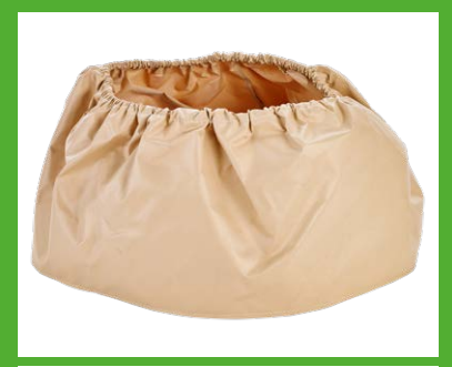
Dust collar Art. No. 01913