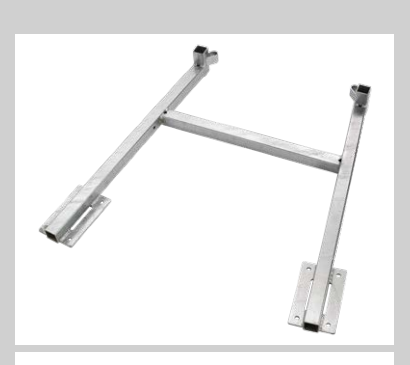
Bolt down flat roof support Art. No. 52104