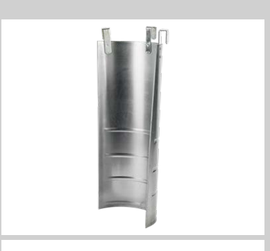
Chute liner Art. No. 01919