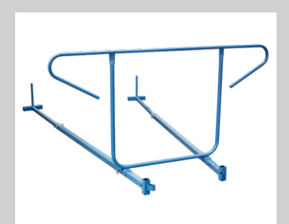
Flat roof support Art. No. 01911