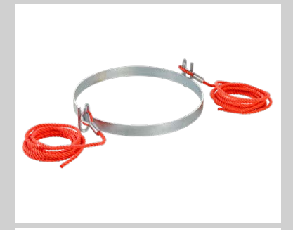
Deflector ring Art. No. 01918

For further accessories visit: www.geda.de