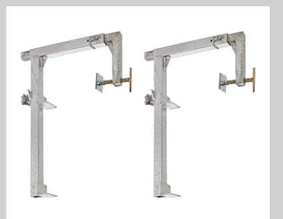
Set of balcony clamps Art. No. 01902