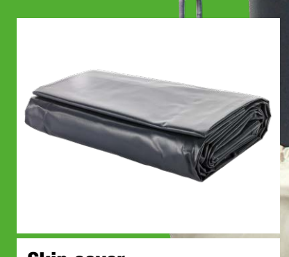
Skip cover Art. No. 01917