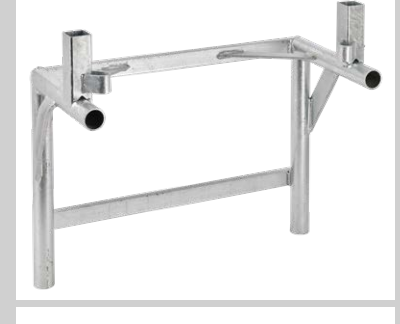
Fixing frame Art. No. 01904