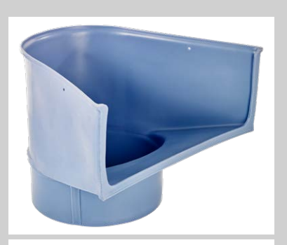
Dump hopper Art. No. 08922