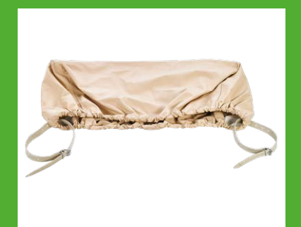
Dust protection hood Art. No. 01909